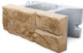
NEW! 6-28 Face 4' x 18", Width 28"

The 6 SF Block allows for tighter turning radius, wall steps at 18" increments and vertical and horizontal adjustments. Also includes a top block with recess.