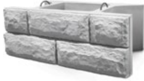
24 SF BLOCK Face 8' x 3', Width 44"

The 24 SF Block contributes to the speed of installation. A small crew and a couple pieces of equipment can install 1,200 SF a day.