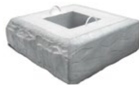
90° BLOCK Face 4' x 18", Width 4'

A perfect solution for smaller walls, get up to 60 pieces per truckload. Easy to move around on-site with a skid loader or mini-excavator.