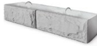
DUAL FACE BLOCK Face 8' x 18", Width 28"

The 90° Block provides for inside and outside 90° turns.