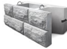
24 SF MASS EXTENDER BLOCK Face 8' x 3', Width 56"

Setting the standard for tall gravity walls. At 22.5', it can go vertical with no tie-back.