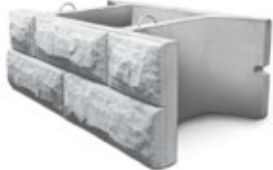
24-62 Face 8' x 3', Width 62"

The addition of the extender to the 24 SF Block provides for greater gravity wall heights.