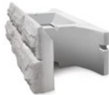
24 SF TOP BLOCK Face 8' x 3', Width 44"

Build walls up to 18' tall with no tie-back.