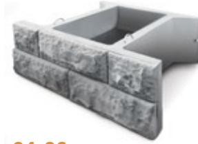
24-86 Face 8' x 3', Width 86"

The 24 SF Block contributes to the speed of installation. A small crew and a couple pieces of equipment can install 1,200 SF a day.