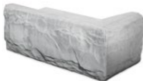
END/CORNER BLOCK Face 4' x 18", Width 2'

The Dual Face Block provides for above-grade applications.