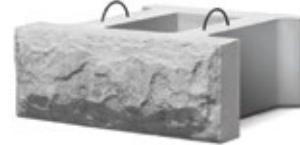
6 SF BLOCK Face 4' x 18", Width 44"

The Top Block has an 8" recess at the top of the face to allow for multiple finish options.