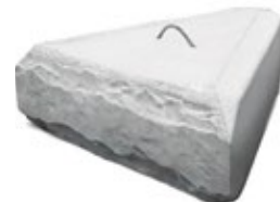
45° BLOCK Face 4' x 18" x 8.25"

The End/Corner Block is used for 90° turns and for end finish treatments.